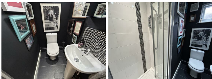
Shower cubicle, two piece white suite.